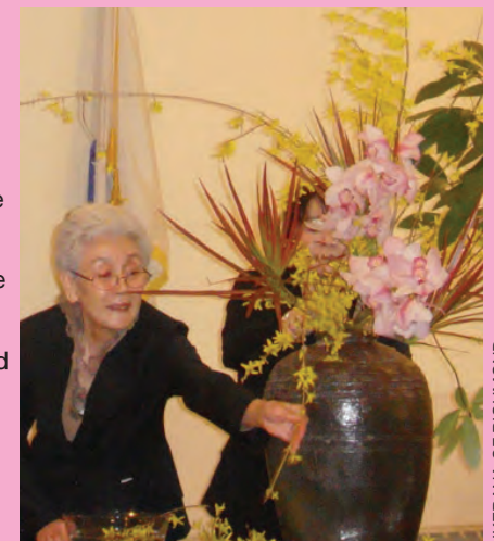
IKEBANA OF RICHMOND