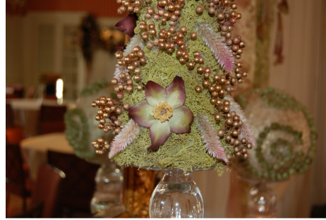
Features hand-crafted botanicals