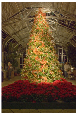
Holiday tree in the Conservatory's north wing

Conservatory. Enjoy breathtaking plantings and special holiday displays including a 100-foot holiday tree in the north wing.