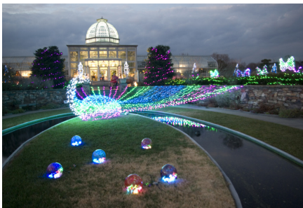
GardenFest of Lights 2007

*Groups of 50 people or more are limited to the 7:30 pm seating time.