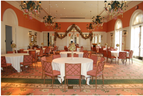
Robins Room during GardenFest