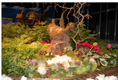
Fairy House in the Conservatory Train Display

Indoor Displays. Visit the Education and Library Complex to view beautiful holiday trees creatively decorated by Henrico County elementary school students. The Library features magnificent holiday trees decorated with hand-crafted garden botanical ornaments, and don't miss our ever-popular train display located down the hall in Classroom 1.