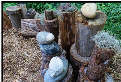
Gnome Home Creation Station

Make your own Wild Art at a Creation Station. You can build a gnome home, balance a rock cairn, pattern a mandala or do all three. Check your Wild Art map for locations.