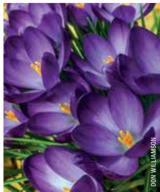
late winter/early spring

Woodland crocus Crocus tommasinianus 'Ruby Giant'