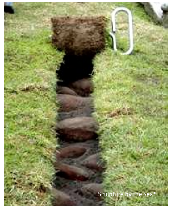
Sculpture by the Sea*