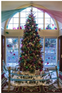
Holiday Tree in the Library 2016

Indoor Displays. Visit the Kelly Education Center to view beautiful holiday trees creatively decorated by Henrico County elementary school students. The Library features magnificent holiday trees decorated with hand-crafted garden botanical ornaments, and don't miss our ever-popular train display located down the hall in Classroom 2.