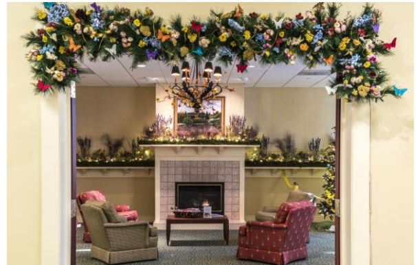
Reading Room located in the Library

Conservatory. Enjoy breathtaking plantings and special holiday displays including a 20-foot holiday tree in the north wing.