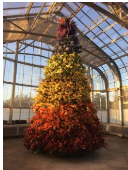
Holiday tree in the Conservatory's North Wing 2016

Conservatory. Enjoy breathtaking plantings and special holiday displays including a 20-foot holiday tree in the north wing.