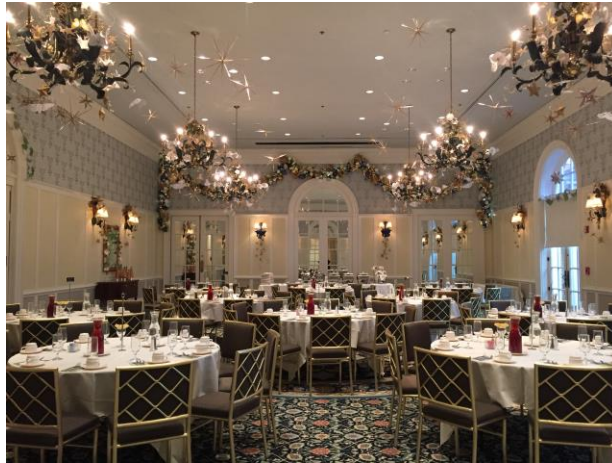
Robins Room during GardenFest 2016