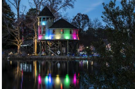
Children's Garden Tree House 2016 Don Williamson

Outdoor Displays. Stroll garden and lakeside paths festively illuminated with a half-million colorful lights – please dress weather appropriate!