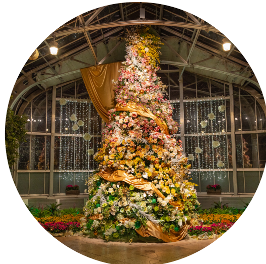
Holiday Tree, Conservatory Michael Simon

Please dress weather appropriate so you can take in festively illuminated garden and lakeside pathways.