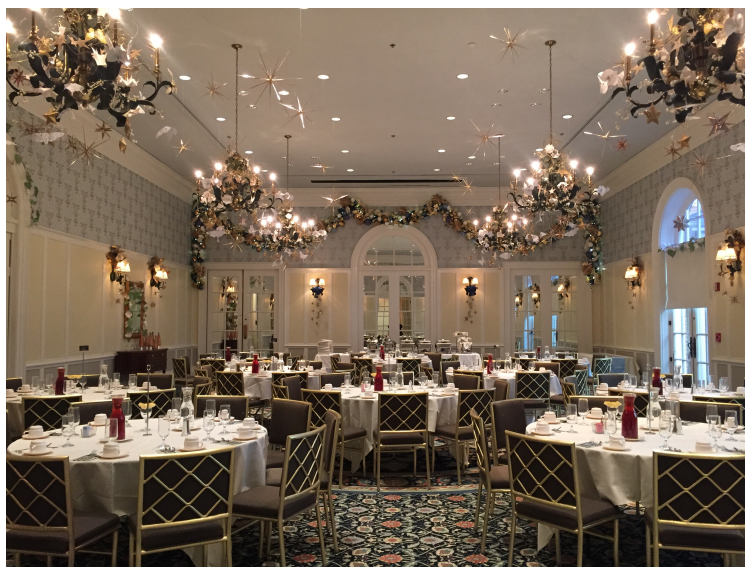
Robins Room during GardenFest of Lights 2016

Prices range from $40 to $42 per person. Admission to GardenFest of Lights, the regions most spectacular holiday light show that changes every year, is included!