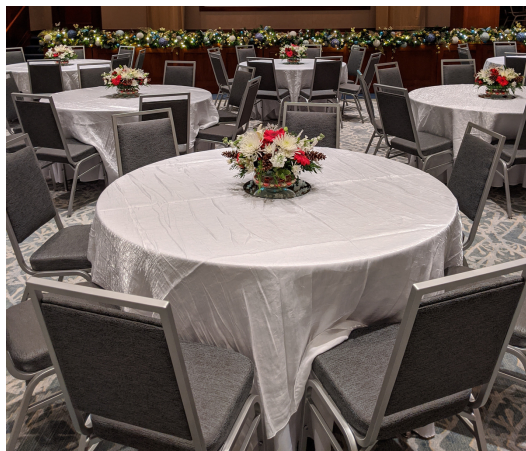
Kelly Education Center - Auditorium

The dinner package is offered Sunday - Tuesday, beginning November 23, 2020-January 10, 2021, for groups of 15 to 66 and is a wonderful option for family, corporate or association group holiday dinners. There are 3 dining group sizes, one for 15 to 36 guests, one for 15 to 30 guests and the final for 36 to 66 guests. Groups of 36 guests or more are limited to the 7:30pm reservation time. *Nov 22 and Dec 20, 21, 22 are NOT AVAILABLE.