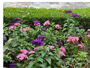
Evelyn G. Luck Garden

Heliotrope, Heliotropium arborescens ‘Marine’ . This native of Peru became a staple of European cottage gardens and a Victorian favorite. The dark-purple flower heads have a sweet floral scent, with notes of vanilla, which explains its use in 19 th century perfumes and cosmetics. Treat heliotrope as a summer annual bedding plant or a container plant that can be over-wintered inside. Pinch-back the plants to promote bushy growth and deadhead to promote flowering. All parts of the plant are toxic and should not be ingested.