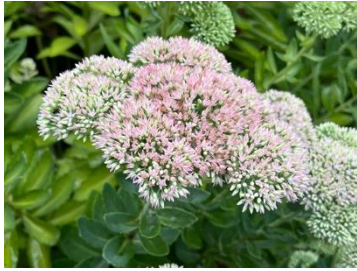
H. 'Lajos' Autumn Charm™ in Fountain Garden West

Stonecrop, Hylotelephium (syn. Sedum ), is a succulent herbaceous perennial that is beginning its autumn show. While forgiving of drought and poor rocky soil, all sedums need sun, heat and good drainage. These clump-forming plants range in size from creeping to 3'. The flat-topped showy flower color develops from green to pink or red. Bees and butterflies love them. Cut off a stem in the spring and you can root another plant. Throughout.