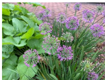
Allium ‘Lavender Bubbles’ in Meditation Garden

Ornamental onion, Allium . This hybrid onion bulb has umbrels of green-turning-pink flowers held tall on individual scapes. A stunning plant for the edge of a border, this onion is a well-behaved clump-forming plant that won’t spread or self-seed if dead-headed. We’ve watched this through the summer as flowers fade – and now have been replaced by a second flush! The slight onion fragrance deters deer and rabbits but won’t keep one from using the cut flowers indoors. Fountain Garden, Meditation Garden & throughout.