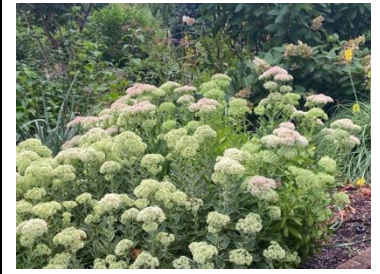
H. 'Lajos' Autumn Charm™ in Fountain Garden West

Stonecrop, Hylotelephium (syn. Sedum ), is a succulent herbaceous perennial that is beginning its autumn show. While forgiving of drought and poor rocky soil, all sedums need sun, heat and good drainage. These clump-forming plants range in size from creeping to 3'. The flat-topped showy flower color develops from green to pink or red. Bees and butterflies love them. Cut off a stem in the spring and you can root another plant. Throughout.