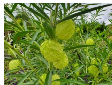
Four Seasons Garden

Balloon plant, Gomphocarpus physocarpa , a member of the milkweed family from South Africa, is grown in Richmond as a seasonal annual. (USDA Zone 8-10). This tall (up to 6’), back of the border plant is a source of nectar for monarch butterflies and is pollinated only by vespid wasps and hornets. Clusters of insignificant creamy-white vanilla scented flowers are followed by odd looking fruit that resembles spiny lime-green balloons. Dried, these seed pods are handsome additions to floral arrangements.