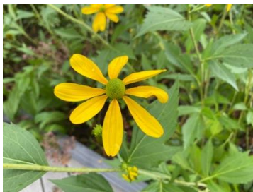
Main Garden Walk

Green-headed coneflower, Rudbeckia laciniata , an Eastern native perennial, is different from most Rudbeckias as it sports a green cone. Give this deer resistant plant plenty of room, as it grows 3-10' tall and spreads by underground roots. It will bloom in sun, part sun or shade, and prefers a moist location. The flowers are enjoyed by many kinds of bees, beneficial wasps and butterflies. After flowering, leave the seed heads and watch the goldfinches flock to get the seed!