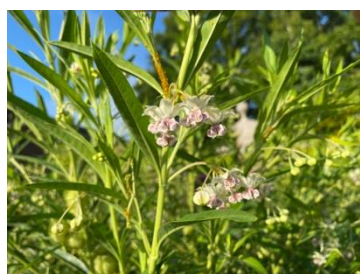
Four Seasons Garden

While early spring sunshine inspires us all to plant something as winter departs, fall is really the optimal time to plant in Virginia. The soil does not freeze in our temperate winter, allowing roots to settle in and develop before facing the summer’s scorching heat. Local stores display rows of yellow or maroon chrysanthemums at this time of year, but they are not your only option. Visit the Garden to identify some fall blooming plants and shrubs you might like to consider acquiring. And be sure to visit our fall Plant Sale ( September 15-16 ) to view hundreds of possibilities, allowing you to select from a varied color palette and encounter a selection of native plants that will delight our local pollinators.