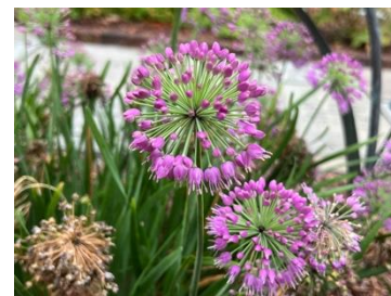
Allium ‘Lavender Bubbles’ in Meditation Garden

Ornamental onion, Allium . This hybrid onion bulb has umbrels of green-turning-pink flowers held tall on individual scapes. A stunning plant for the edge of a border, this onion is a well-behaved clump-forming plant that won’t spread or self-seed if dead-headed. We’ve watched this through the summer as flowers fade – and now have been replaced by a second flush! The slight onion fragrance deters deer and rabbits but won’t keep one from using the cut flowers indoors. Fountain Garden, Meditation Garden & throughout.