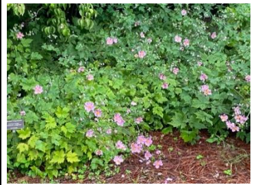
Main Garden Walk & throughout

Windflower, Anemone hupehensis , is a native of the Chinese province Hupeh. Victorian plant hunter Robert Fortune introduced it to Europe in 1844. This perennial is anchored by a basal rosette of dark-green leaves and has shallow saucer-like flowers in pink or white, single or double, which sway in the breeze at the end of long wiry stems. Plant in a protected location with soft shade and moist fertile soil. Main Garden Walk & throughout.