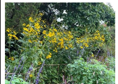
Main Garden Walk

Green-headed coneflower, Rudbeckia laciniata , an Eastern native perennial, is different from most Rudbeckias as it sports a green cone. Give this deer resistant plant plenty of room, as it grows 3-10' tall and spreads by underground roots. It will bloom in sun, part sun or shade, and prefers a moist location. The flowers are enjoyed by many kinds of bees, beneficial wasps and butterflies. After flowering, leave the seed heads and watch the goldfinches flock to get the seed!