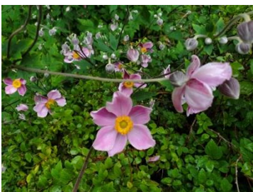
Main Garden Walk & throughout

Windflower, Anemone hupehensis , is a native of the Chinese province Hupeh. Victorian plant hunter Robert Fortune introduced it to Europe in 1844. This perennial is anchored by a basal rosette of dark-green leaves and has shallow saucer-like flowers in pink or white, single or double, which sway in the breeze at the end of long wiry stems. Plant in a protected location with soft shade and moist fertile soil. Main Garden Walk & throughout.