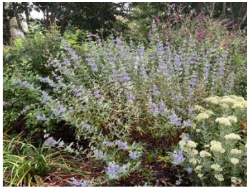
Caryopteris x clandonensis 'Dark Knight' in Fountain Garden West

Bluebeard, Caryopteris × clandonensis . True blue flowers are always highly prized in the garden and this low shrub gets the gold. In late summer, blue flowers with “beards” of leaves at their base resemble clouds of smoke as they grow along the stems. Brush your hand across the silvery-gray foliage to release a lovely fragrance. This shrub is always covered with butterflies, bees and other beneficial insects. While it is a pollinator favorite, deer turn up their noses. Healing Garden & elsewhere.