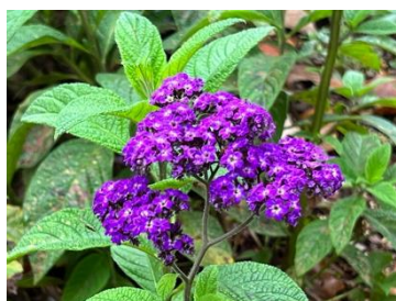
Evelyn G. Luck Garden

Heliotrope, Heliotropium arborescens ‘Marine’ . This native of Peru became a staple of European cottage gardens and a Victorian favorite. The dark-purple flower heads have a sweet floral scent, with notes of vanilla, which explains its use in 19 th century perfumes and cosmetics. Treat heliotrope as a summer annual bedding plant or a container plant that can be over-wintered inside. Pinch-back the plants to promote bushy growth and deadhead to promote flowering. All parts of the plant are toxic and should not be ingested.