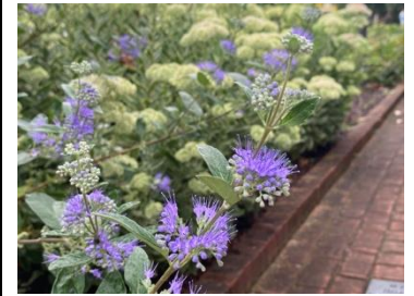
Caryopteris x clandonensis 'Dark Knight' in Fountain Garden West

Bluebeard, Caryopteris × clandonensis . True blue flowers are always highly prized in the garden and this low shrub gets the gold. In late summer, blue flowers with “beards” of leaves at their base resemble clouds of smoke as they grow along the stems. Brush your hand across the silvery-gray foliage to release a lovely fragrance. This shrub is always covered with butterflies, bees and other beneficial insects. While it is a pollinator favorite, deer turn up their noses. Healing Garden & elsewhere.