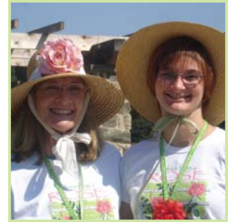
Volunteers during RoseFest 2008.